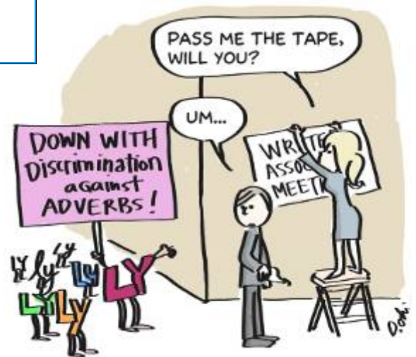
INKYGIRL.COM: DAILY DIVERSIONS FOR WRITERS COPYRIGHT © 2009 DEBBIE RIDPATH OHI. TWITTER: @INKYELBOWS.

What would you do if you knew you couldn't fail? Do it anyway! Write about it.